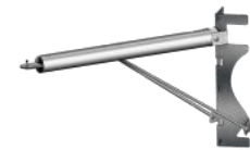
SA 306 Pole Mounting Bracket